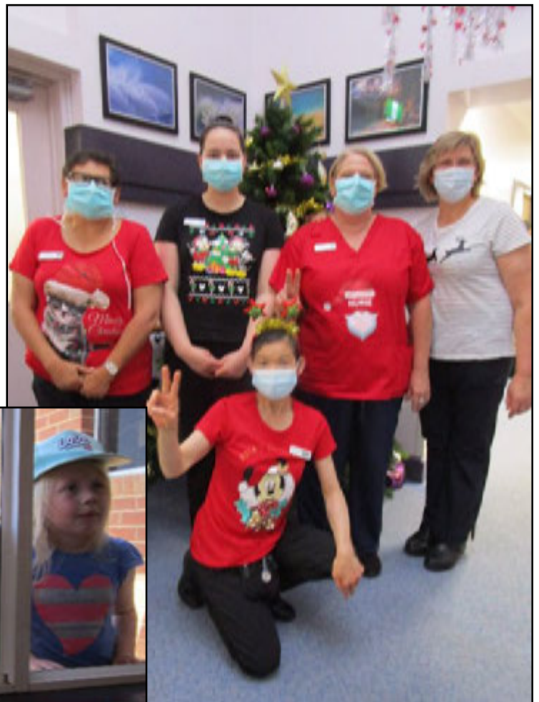
Staff providing Christmas cheer