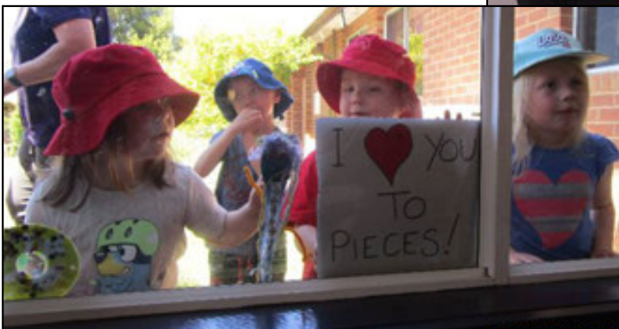
Eildon Kinder Kids with special messages for the residents